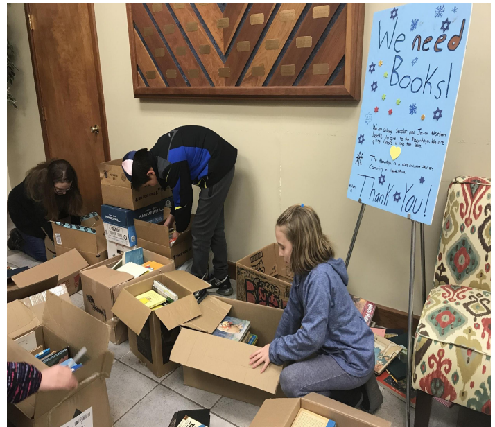
Students in the Hey Class of 5779 organized a temple-wide book drive for students in the Jewish community of Uganda – January 2019